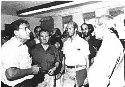
GNF Collection 2 BK5-PT2.JPG