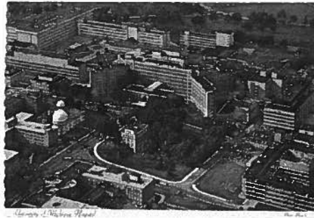
GNF Collection 20 BK5-PT20.jpg