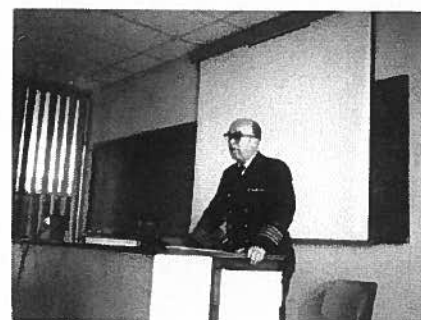
GNF Collection 39 BK5-PT39.jpg