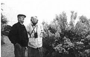
GNF Collection -7 BK5-PT7.jpg