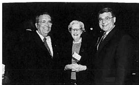
GNF Collection 16 BK5-PT16.jpg