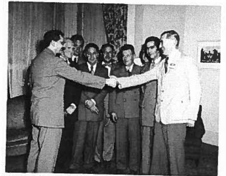
GNF Collection 30 BK5-PT30.jpg