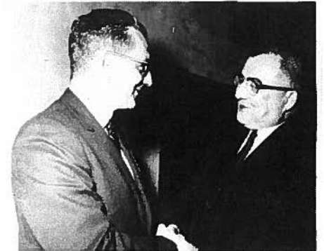
GNF Collection 24 BK5-PT24.jpg