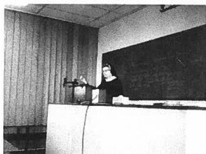
GNF Collection 40 BK5-PT40.jpg