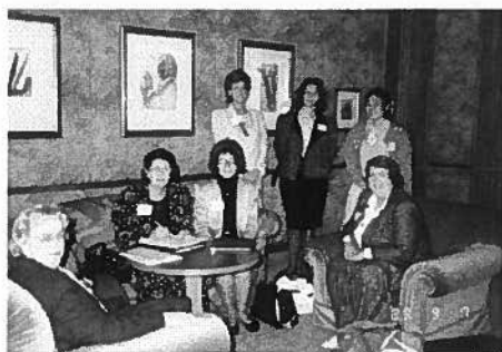
GNF Collection 11 BK5-PT11.jpg