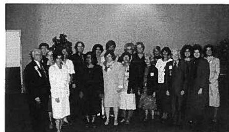
GNF Collection 12 BK5-PT12.jpg