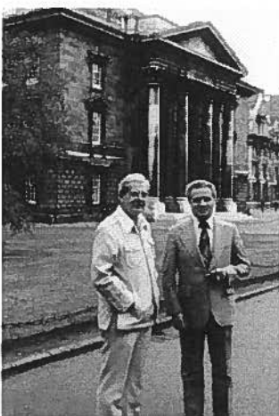
GNF Collection 34 BK5-PT34.jpg