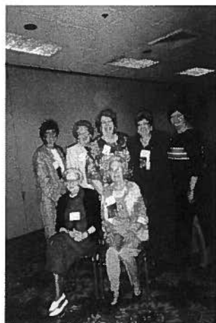
GNF Collection 13 BK5-PT13.jpg