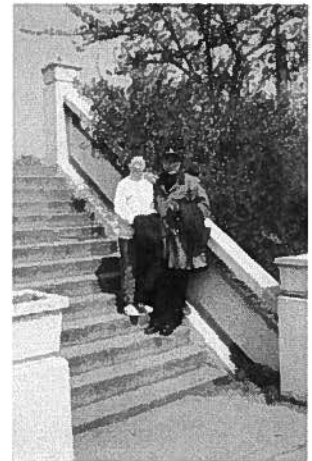
GNF Collection 6 BK5-PT6.jpg