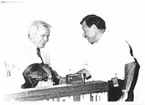
GNF Collection 4 BK5-PT4.JPG