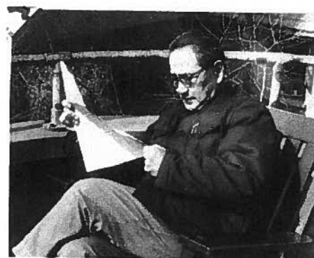
GNF Collection 42 BK5-PT42.jpg