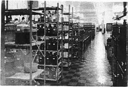
GNF Collection 19 BK5-PT19.jpg