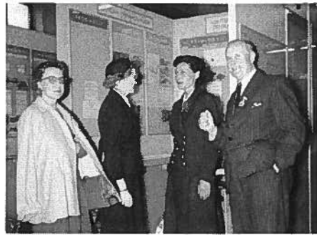
GNF Collection 5 BK5-PT5.JPG