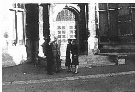
GNF Collection 37 BK5-PT37.jpg