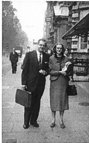
GNF Collection 32 BK5-PT32.jpg