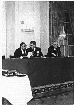
GNF Collection 46 BK5-PT46.jpg