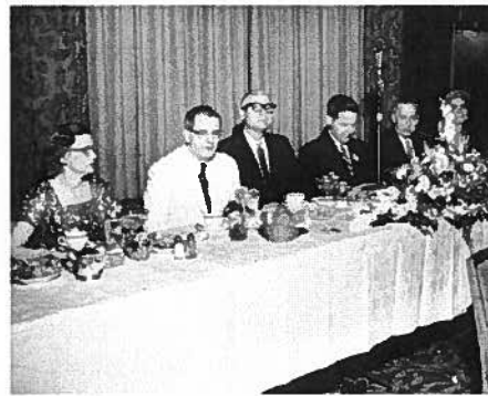
GNF Collection 23 BK5-PT23.jpg