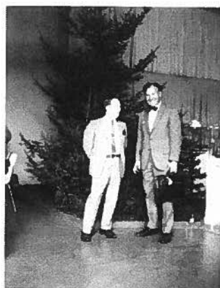
GNF Collection 41 BK5-PT41.jpg