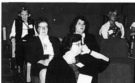
WORLD CONGRESS OF PHARMACY 96 - JERUSALEM, ISRAEL