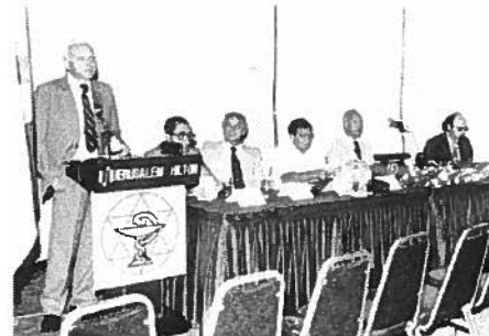
GNF Collection 1 BK5-PT1.JPG