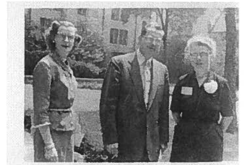
GNF Collection 33 BK5-PT33.jpg