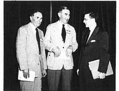
GNF Collection 21 BK5-PT21.jpg