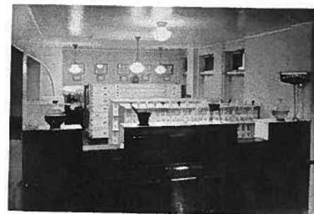
GNF Collection 18 BK5-PT18.jpg