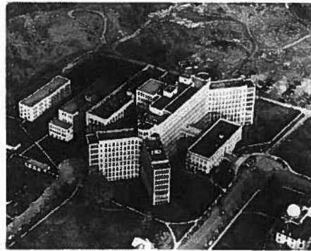
GNF Collection 29 BK5-PT29.jpg