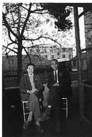
GNF Collection 43 BK5-PT43.jpg