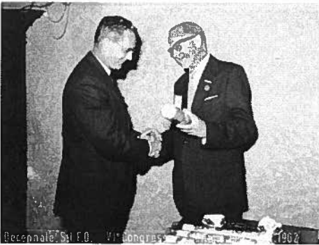
GNF Collection 22 BK5-PT22.jpg