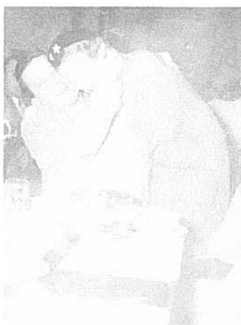
GNF Collection 38 BK5-PT38.jpg