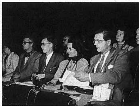
GNF Collection 26 BK5-PT26.jpg