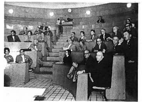
GNF Collection 27 BK5-PT27.jpg