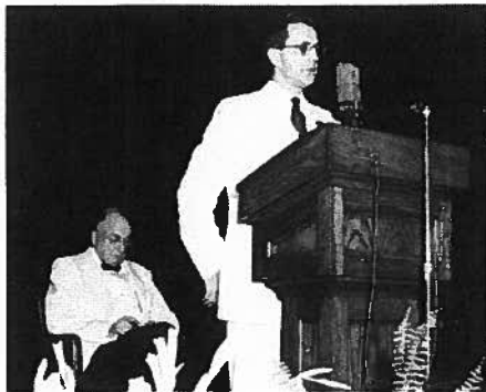
GNF Collection 25 BK5-PT25.jpg