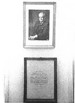
GNF Collection 3 BK5-PT3.JPG