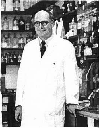
GNF Collection 28 BK5-PT28.jpg