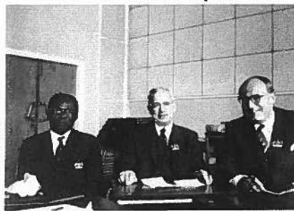
GNF Collection 35 BK5-PT35.jpg