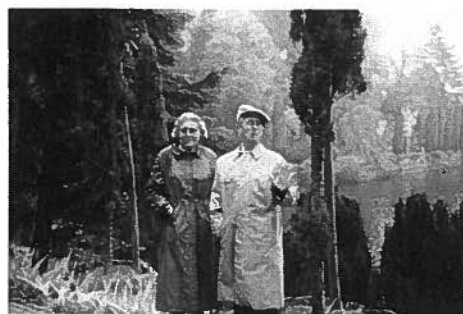
GNF Collection -44 BK5-PT44.jpg