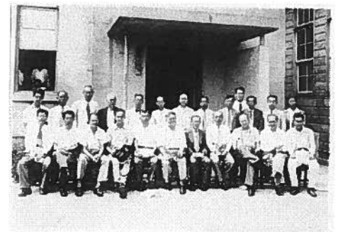
GNF Collection 9 BK5-PT9.jpg