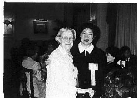
GNF Collection 45 BK5-PT45.jpg