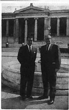
GNF Collection 31 BK5-PT31.jpg