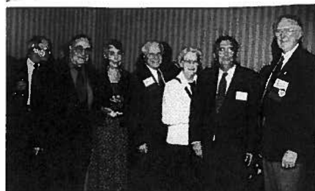
GNF Collection 15 BK5-PT15.jpg