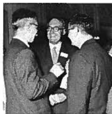
GNF Collection 8 BK5-PT8.jpg