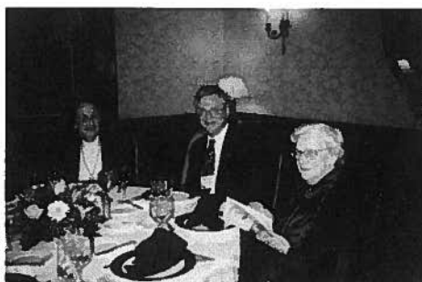
GNF Collection 14 BK5-PT14.jpg