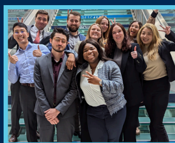
PAL Social at ASHP's Midyear Clinical Meeting in New Orleans

Past PALRC Chairs joined us as panelists to share their insight from their PAL residency experience.